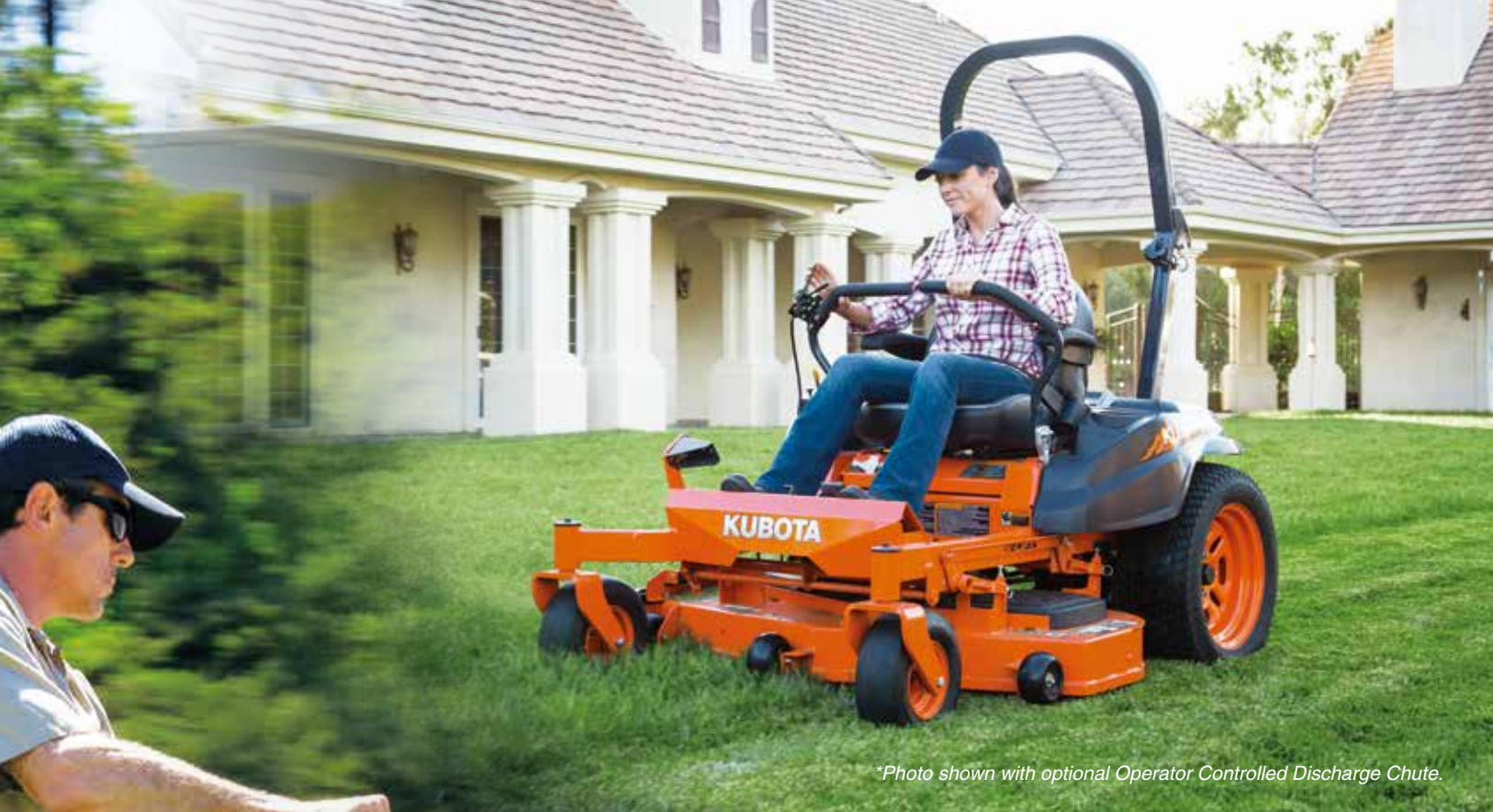
*Photo shown with optional Operator Controlled Discharge Chute.